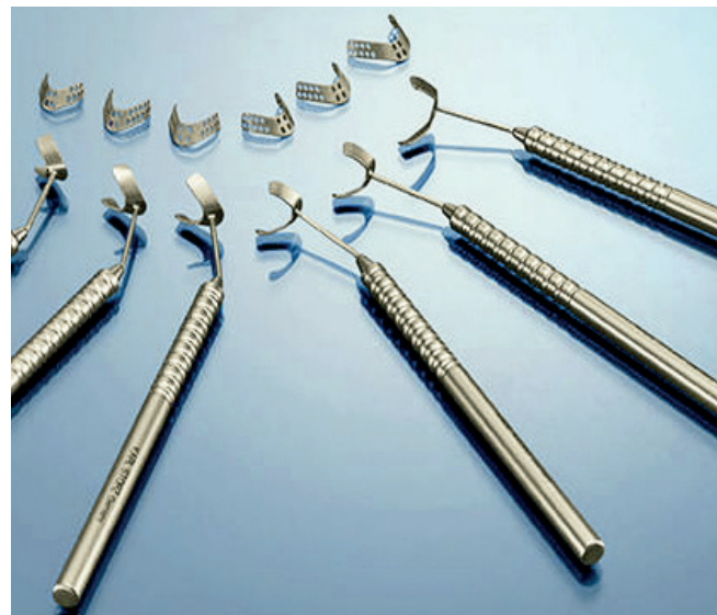
Six "sizers" in the sizes XS, S, M, L, XL and XXL are used during the surgery to determine size.